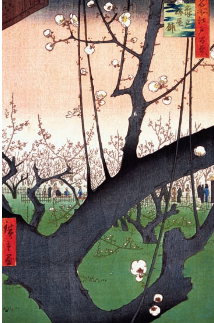
Plum Garden, Kameido from One Hundred Views of Famous Places in Edo (1857), Utagawa Hiroshige.

On sweet plum blossoms 1 The sun rises suddenly. Look, a mountain path! A